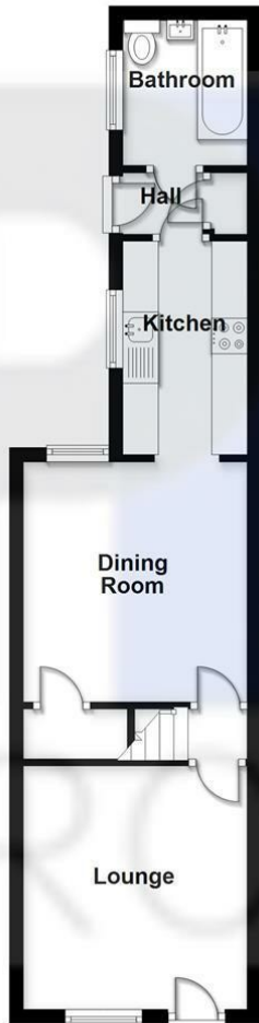
Ground Floor Approx. 35.1 sq. metres (377.9 sq. feet)